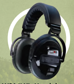
WSA II XL Headphones