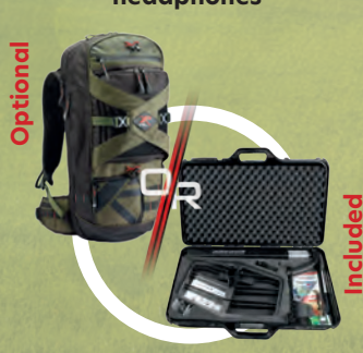
Easy to transport