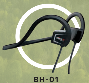
Bone conduction headphones