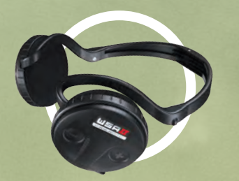
WSA II Headphones